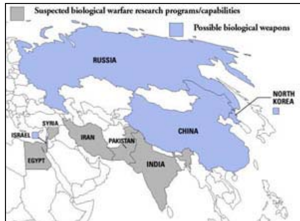
Figure 3. The world's biological weapons states, from Deadly Arsenals 15

destroyed biological stockpiles, some may remain. Other states such as Israel, China, and North Korea may have the capability to produce significant quantities of biological agents for military use. Iran, Pakistan, India, Egypt, and Syria are suspected of trying to acquire the capability (see Figure 3). 14