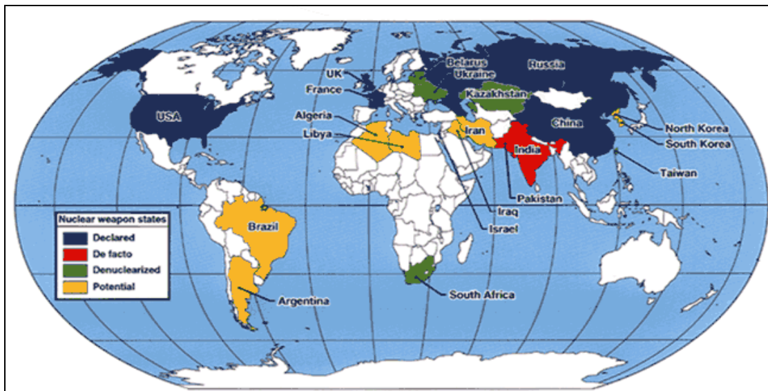
Figure 1. Declared, de facto, and threshold nuclear states, from NNSA 9

According to the Carnegie Endowment for International Peace, worldwide nuclear stockpiles are now estimated to total over 28,000 nuclear weapons; these include: 10,000 from the U.S., 17,000 from Russia, 410 from China, 350 from France, 185 from the U.K., 100 from Israel, 50-90 from India, and 30-50 from Pakistan. 8 Adding to the list of current nuclear states and potential nuclear states are two prongs of the George W. Bush Administration's axis of evil, Iran and North Korea (see Figure 1).