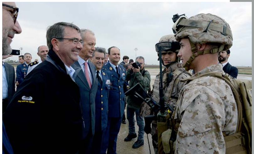
Secretary Carter and Spanish Defense Minister Pedro Morenes speak with Marines after observing an airfield seizure bilateral capabilities exercise on Morón Air Base, Spain.

That said, because many of the remaining detainees currently cannot be safely transferred to another country, we need an alternative to this detention facility. Therefore, I support the President's plan to establish and bring those detainees to an appropriate, secure, alternative location in the United States. I appreciate that Congress has indicated a willingness to consider such a proposal, and, in accordance with the 2016 National Defense Authorization Act, DoD delivered that plan to Congress earlier this week. We look forward to working with Congress to identify the most appropriate design, legislative foundation, and geographic location for future detention and to lift the restrictions preventing the responsible closure of the facility at Guantanamo.