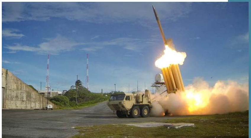
The first of two Terminal High Altitude Area Defense (THAAD) interceptors is launched during a successful intercept test.

The budget also invests $9.1 billion for missile defense in FY 2017, and $47.1 billion over the FYDP. This reflects important decisions we've made to strengthen and improve our missile defense capabilities — particularly to counter the anti-access, area-denial challenge of increasingly precise and increasingly long-range ballistic and cruise missiles being fielded by several nations in multiple regions of the world. Instead of spending more money on a smaller number of more traditional and expensive interceptors, we're funding a wide range of defensive capabilities that can defeat incoming missile raids at much lower cost per round, and thereby impose higher costs on the attacker. The budget invests in improvements that complicate enemy targeting, harden our bases, and leverage gun-based point defense capabilities — from upgrading the Land-Based Phalanx Weapons System, to developing hypervelocity smart projectiles that as I mentioned earlier can be fired not only from the five-inch guns at the front of every Navy destroyer, but also the hundreds of Army M109 Paladin self-propelled howitzers.