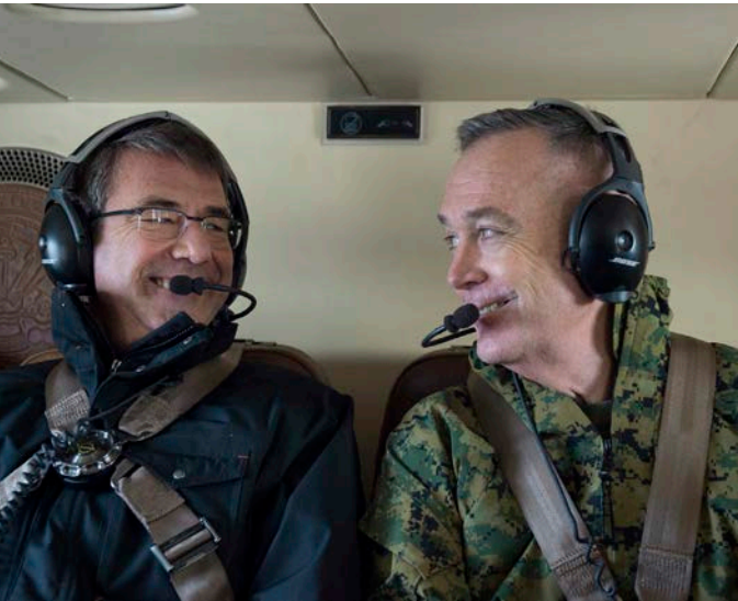
Secretary Carter and chairman of the Joint Chiefs of Staff Gen. Joseph Dunford.

As I've said consistently from the moment I became Secretary of Defense, I cannot ask for more taxpayer dollars for defense without being candid about the fact that not every defense dollar is spent as wisely or responsibly as it could be, and also being determined to change that and make our department more accountable. That's why reforming the DoD enterprise is so important — from improving how we're organized so we can best respond to the challenges and opportunities of the future security environment, to continuing to improve our acquisition and enterprise-wide business and audit practices, to reducing excess infrastructure and overhead, to modernizing the military healthcare system.