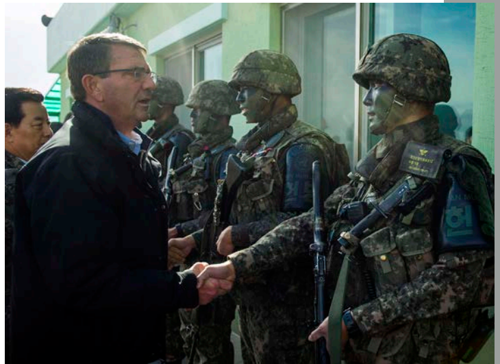
Secretary Carter shakes hands with Republic of Korea Army Soldiers during a visit to The Korean Demilitarized Zone.

North Korea’s nuclear test on January 6th and its ballistic missile launch on February 7th were highly provocative acts that undermine peace and stability on the Korean Peninsula and in the region. The