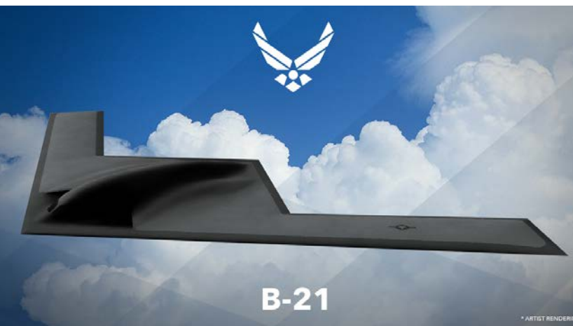
U.S. Air Force Concept

To ensure the U.S. military's continued air superiority and global reach, the budget makes important investments in several areas — and not just platforms, but also payloads. For example, it invests $2.4 billion in FY 2017 and $8 billion over the FYDP in a wide range of versatile munitions — including buying more Small Diameter Bombs, JDAMs, Hellfires, and AIM-120D air-to-air missiles. We are also developing hypersonics that can fly over five times the speed of sound.