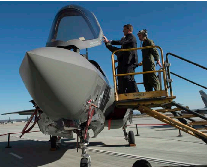
Secretary Carter looks into the cockpit of a F-35B at Marine Corps Air Station Miramar, Calif.

and 195,000 soldiers in the Army Reserve — comprising 56 total Army brigade combat teams and associated enablers — and a Marine Corps of 182,000 active-duty Marines and 38,500 Marine reservists. For the Navy, the budget continues to grow the size, and importantly the capability, of the battle fleet — providing for 380,900 active-duty and reserve sailors in FY 2017, and an increase from 280 ships at the end of FY 2016 to 308 ships at the end of the FYDP. The budget also supports an Air Force of 491,700 active-duty, reserve, and National Guard airmen — maintaining 55 tactical fighter squadrons over the next five years, and providing sufficient manpower to address high operating tempo and shortfalls in maintenance specialists for both tactical fighters and remotely-piloted aircraft.