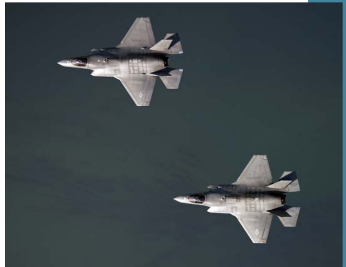
Two F-35s fly during a recent training exercise.

Recognizing the immense value that wargaming has historically had in strengthening our force in times of strategic, operational, and technological transition — such as during the interwar years between World War I and World War II, when air, land, and naval wargamers developed innovative approaches in areas like tank warfare and carrier aviation — this budget makes significant new investments to reinvigorate and expand wargaming efforts across the Defense Department. With a total of $55 million in FY 2017 as part of $526 million over the FYDP, this will allow us to try out nascent operational concepts and test new capabilities that may create operational dilemmas and impose unexpected costs on potential adversaries. The results of future wargames will be integrated into DoD's new wargaming repository, which was recently established to help our planners and leaders better understand and shape how we use wargames while also allowing us to share the insights we gain across the defense enterprise.