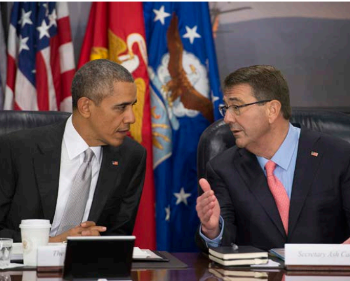
Secretary Carter speaks with President Obama as they meet with the National Security Council about the fight against ISIL at the Pentagon.

DoD must and will address all five of these challenges as part of its mission to defend this country. Doing so requires some new investments on our part, new posture in some regions, and also new and enhanced capabilities.