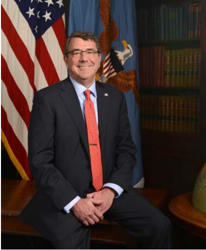
Ash Carter 25th Secretary of Defense

A year ago, I was sworn in as the 25th Secretary of Defense for the United States of America. At that time I made three commitments — the first, to our people, to make sure we take care of them and their families; the second, to the President, to provide him with the best military advice; and the third, to the future — to prepare this country’s Department of Defense (DoD) for the extraordinary changes that are happening in our world and be ready for advances our adversaries are making. We’ve gotten a lot done over the last year, and I’m deeply proud of our work to strengthen the United States military.