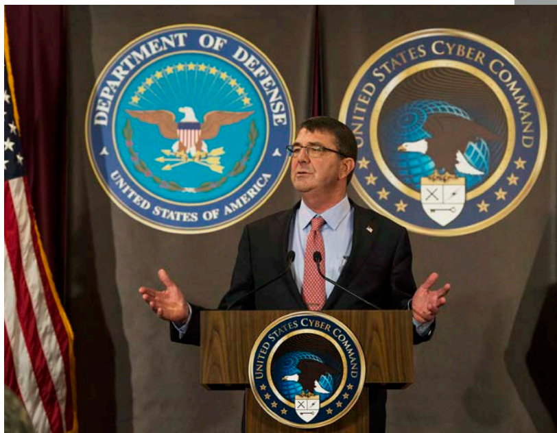
Secretary Carter briefs troops and members of the press at National Security Agency headquarters on Fort Meade, Md.

Meanwhile, with critical investments in other areas, the budget enables DoD to continue to advance our preparations, posture, partnerships, and planning to preserve the President’s options for any contingency. It strengthens the regional security architecture in a way that blunts Iran’s ability to coerce its neighbors. And it helps us stay ahead of the risks posed by Iran’s ballistic missiles, naval forces, cyber capabilities, and support for terrorists and others in the region.