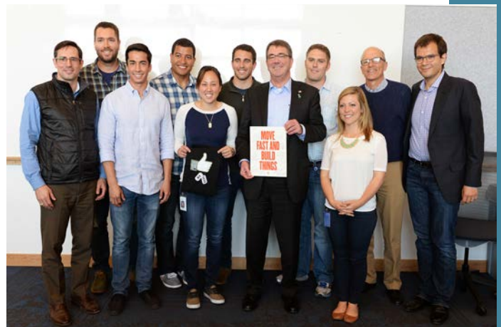
Secretary Carter takes a photograph with Veterans at Facebook.