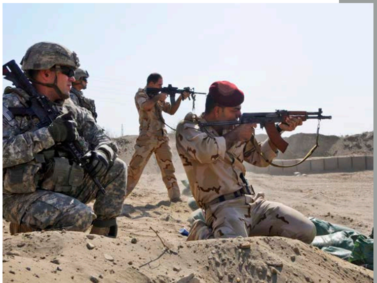
Iraqi soldiers and paratroopers from 1st Battalion, 325th Airborne Infantry Regiment of the 82nd Airborne Division's 2nd Advise and Assist Brigade fire at paper targets, with a variety of weapons during the opening of the Anbar Operation Center's new range in Ramadi, Iraq.

One, destroy the ISIL parent tumor in Iraq and Syria by attacking its two power centers in Mosul, Iraq and Raqqa, Syria; these cities constitute ISIL's military, political, economic and ideological centers of gravity, which is why our plan has big arrows pointing toward both.