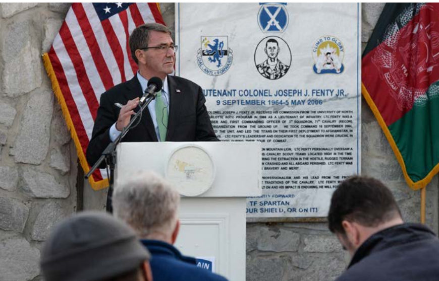
Secretary Carter holds a joint press conference with Defense Minister of Afghanistan Mohammed Masoom Stanekzai at Forward Operating Base Fenty, Jalalabad, Afghanistan.

Our continued presence in Afghanistan is not only a sensible investment to counter threats that exist and stay ahead of those that could emerge in this volatile region; it also supports the willing partner we have in the government