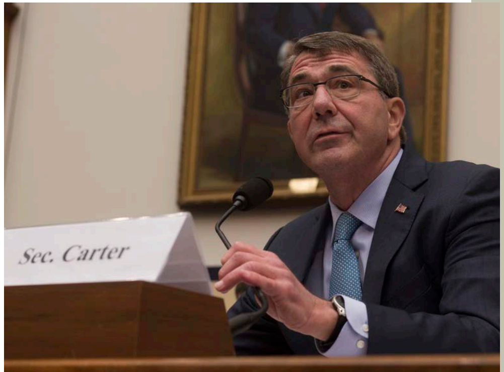
Secretary Carter testifies before Congress.

That same support for what's in this budget is essential today to address the security challenges we face and seize the opportunities within our grasp. We need Congress's support in the decisions that our senior military leaders and I are advocating for. We need Congress to work with us, and not tie our hands, when it comes to pursuing smart and critical reforms. And we need Congress to provide adequate, stable, predictable resources, as only Congress can, by coming together as it has before—including, in the coming years, to avert the return of sequestration once again. As long as that happens, I know our national security and national strength will be on the right path, and America's military will continue to defend our country and help make a better world for generations to come.