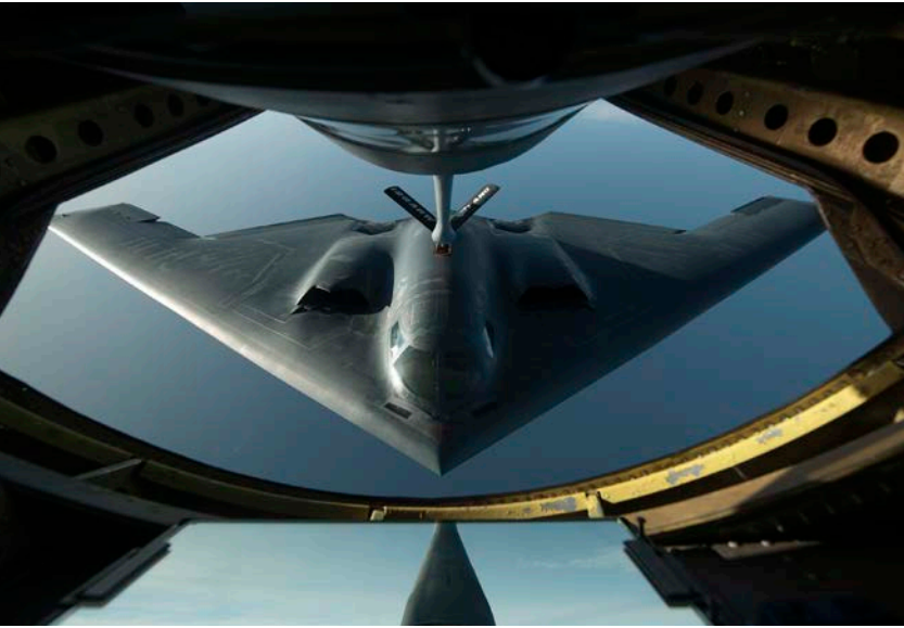
A B-2 Spirit flies into position during a refueling mission.

United States condemns these violations of U.N. Security Council resolutions and again calls on North Korea to abide by its international obligations and commitments. We are monitoring and continuing to assess the situation in close coordination with our regional partners.