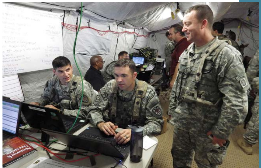
Soldiers from U.S. Army Cyber Protection Brigade discuss the response to a simulated cyber attack on the 1st Brigade Combat Team, 82nd Airborne Division.

Reflecting our renewed commitment to deterring even the most advanced adversaries, the budget also invests in cyber deterrence capabilities, including building potential military response options. This effort is focused on our most active cyber aggressors, and is based around core principles of resiliency, denial, and response.