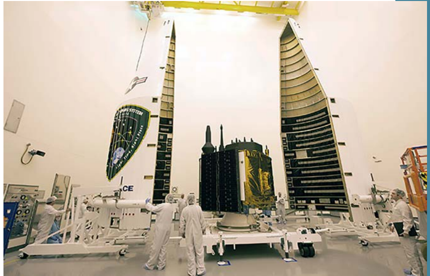
The last GPS IIF satellite is encapsulated inside a payload fairing at a processing facility before it was launched aboard an Atlas V rocket.

Meanwhile, the budget also supports strengthening our current space-based capabilities, and maturing our space command and control. It invests in more satellites for our Space-Based Infrared System to maintain the robust strategic missile warning capability we have today. And it allocates $108 million over the FYDP to implement the Joint Interagency Combined Space Operations Center (JICSpOC), which will better align joint operations in space across the U.S. government.