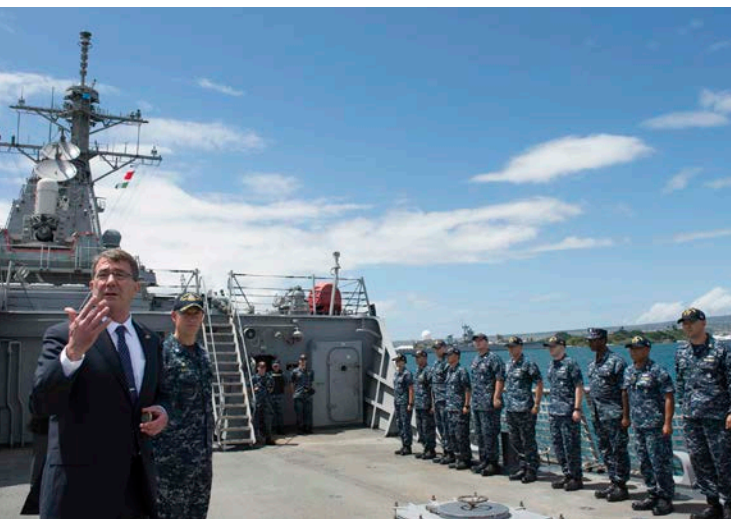
Secretary Carter speaks to Sailors aboard USS John Paul Jones (DDG 53).