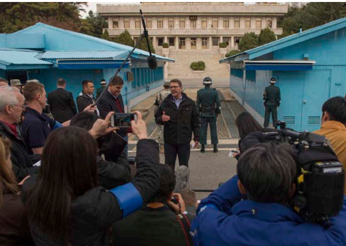
Secretary Carter visits The Korean Demilitarized Zone in the Republic of Korea.

surface warfare ships. They also reflect how we're developing and implementing new posture initiatives – in places like Guam, the Northern Marianas, the Philippines, Australia, and Singapore, as well as modernizing our existing footprint in Korea and Japan – and continuing to strengthen existing partnerships and develop new ones, from India to Vietnam. And they reflect our efforts to support and strengthen a regional security architecture that benefits everyone – from strengthening and modernizing our alliances, to bolstering our ties with the Association of Southeast Asian Nations (ASEAN), to building the security capabilities of our many friends and allies, who increasingly want to do more with us in the region. In support of this effort, the budget fully supports our five-year, $425 million Southeast Asia Maritime Security Initiative begun in FY 2016.