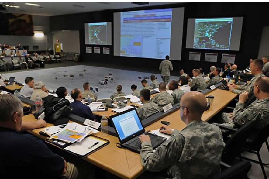
Army North/Joint Force Land Component Command teams up leaders from the Department of Homeland Security, the Department of Health and Human Services, U.S. Northern Command, U.S. Army North, the National Guard Bureau and many others in this simulation.

Because our military has to have the agility and ability to win both the fights we're in, the wars that could happen today, and the wars that could happen in the future, we're always updating our plans and developing new operational approaches to account for any changes in potential adversary threats and capabilities, and to make sure that the plans apply innovation to our operational approaches — including ways to overcome emerging threats to our security, such as cyberattacks, anti-satellite weapons, and anti-access, area denial systems. We're building in modularity that gives our chain of command's most senior decision-makers a greater variety of choices. We're making sure planners think about what happens if they have to