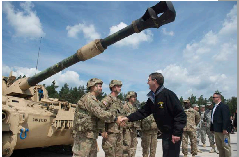
Secretary Carter shakes hands with crew members of an M109A6 Paladin Self Propelled Howitzer at the Grafenwoehr Training Area in Grafenwoehr, Germany.

Since Russia began its illegal attempted annexation of Crimea a little over two years ago, DoD's budgets have made valuable investments in reinforcing our NATO allies; for example, contributing to NATO's Very High Readiness Joint