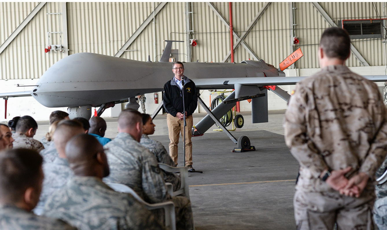
Secretary Carter answers questions from coalition troops at Incirlik Air Base, Turkey.

As this budget addresses those five evolving challenges, it also seizes great opportunities — in supporting new and innovative operational concepts; in pioneering and dominating technological frontiers, including undersea, cyber, space, electronic warfare, and other advanced capabilities; in reforming the defense enterprise; and in building the force of the future. I will address the investments we’re making to do so later.