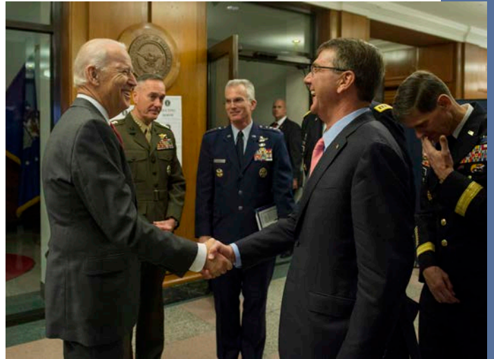
Secretary Carter shakes hands with Vice President Biden before he departs the Pentagon after attending a National Security Council meeting on ISIL.

While we do not desire conflict with any of these nations — and, to be clear, though they pose some similar defense challenges, they are very different nations and situations — we also cannot blind ourselves to the actions they choose to pursue. That is the responsible course of action for the Defense Department. Our military is first and foremost a warfighting force, and even as we seek to deter wars, we must also be prepared to fight and win them, which is itself a key part of deterrence.