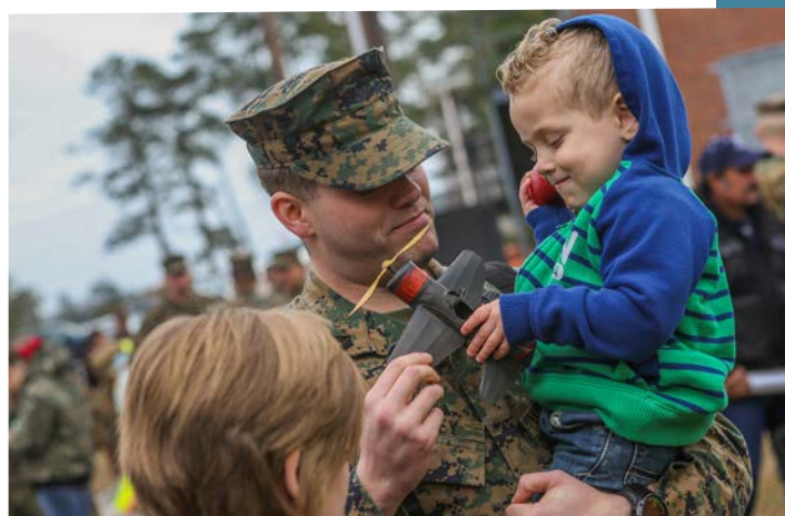
A Marine recently returned from deployment greets his family.