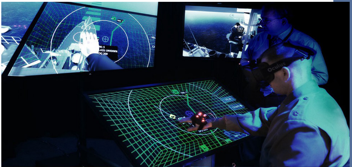
Some of our newest technologies at Space and Naval Warfare Systems Command (SPAWAR).

Context is important here. A few years ago, following over a decade when we were focused on large-scale counterinsurgency operations in Iraq and Afghanistan, DoD began embarking on a major strategy shift to sustain our lead in full-spectrum warfighting. While the basic elements of our resulting defense strategy remain valid, it's also been abundantly clear to me over the last year that the world has not stood still since then — the emergence of ISIL, and the resurgence of Russia, being just the most prominent examples.