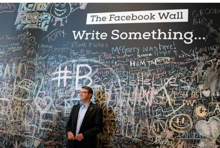
Secretary Carter stands in front of the Facebook wall during his trip to their headquarters.

I outlined the first link we're building to the force of the future at George Washington University last November, announcing over a dozen new initiatives in several categories that are intended to make our future Defense Department better connected to 21st century talent.