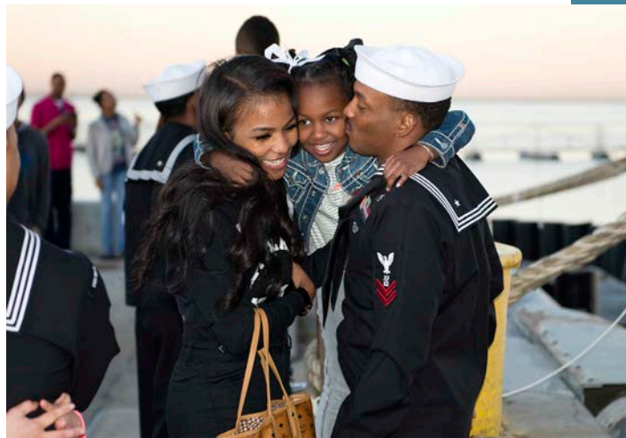
A sailor says goodbye to his family pier side prior to the departure of amphibious assault ship USS Boxer (LHD 4).

To build the force of the future, tackling these problems is imperative, especially when the generation coming of age today places a higher priority on work-life balance. These Americans will make up 75 percent of the American workforce