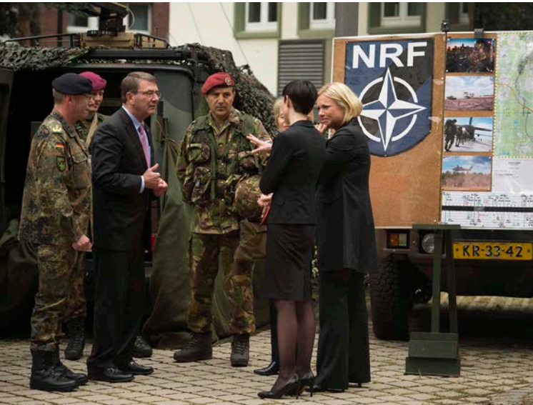
Secretary Carter and Ministers of Defense from Germany, the Netherlands and Norway speak with soldiers from the NATO rapid response force at the 1 German Netherlands Corps in Muenster, Germany.

In addition, the budget reflects how we're doing more, and in more ways, with specific NATO allies. Given increased Russian submarine activity in the North Atlantic, this includes building toward a continuous arc of highly-capable maritime patrol aircraft operating over the Greenland-Iceland-United Kingdom gap up to Norway's North Cape. It also includes the delivery of Europe's first stealthy F-35