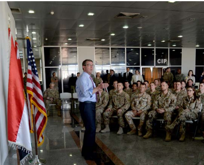
Secretary Carter speaks to soldiers from a number of nations providing training to Iraqi forces in Northern Iraq.

To eliminate the parent tumor in Iraq and Syria, DoD is enabling local, motivated forces with critical support from a global coalition wielding a suite of capabilities-ranging from airstrikes, special forces, cyber tools, intelligence, equipment, mobility and logistics, training, advice and assistance. It must be local forces who deliver ISIL a lasting