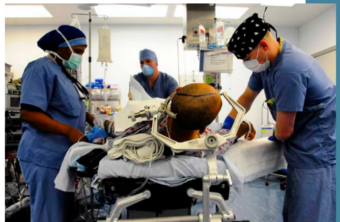
Medical staff with the 455th Expeditionary Medical Operations Squadron prepare a patient for brain surgery.

DoD greatly appreciates that Congressional leaders have said 2016 will be the year to reform our military healthcare system, TRICARE, after having passed retirement modernization reform in 2015. As Congress knows, DoD has proposed various ways to reform TRICARE for several years, so we look forward to working very closely with Congress in the year ahead. The reforms reflected in the budget give beneficiaries more simplicity and choice in how they manage their healthcare, while also incentivizing the much more affordable use of military treatment facilities. This will not only save money, but also maximize the workload and readiness of our military's medical force, giving our doctors, nurses, medics, and corpsmen the experience they need to be effective at their mission. Together this should generate about $548 million in FY 2017 and almost $7 billion over the FYDP that can be better spent in other ways without sacrificing the care of our people. It's time to get this done.