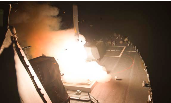
USS Arleigh Burke (DDG 51) launches Tomahawk cruise missiles to conduct strikes against ISIL targets.

Now, with all of that in mind — from why we need to invest in technological innovation, to how we’re doing it — let me address the specific investments this budget makes in technologies and capabilities to deter, and if necessary fight and win, a full-spectrum conventional war against even the most high-end of adversaries. In concert, they will help maintain our military’s edge both under and on the sea, on land, in the air, in space, in cyber and electronic warfare, and in the modernization and maintenance of our nuclear enterprise.