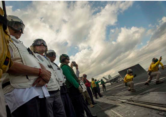
Secretary Carter and India's Minister of Defense Manohar Parrikar observe flight operations as they tour the USS Dwight D. Eisenhower.

strategic advantage in an area that's critically important to America's political, economic, and security interests. Investments in the budget reflect how we're moving more of our forces to the region – such as 60 percent of our Navy and overseas Air Force assets – and also some of our most advanced capabilities in and around the region, from F-22 stealth fighter jets and other advanced tactical strike aircraft, to P-8A Poseidon maritime surveillance aircraft, to our newest