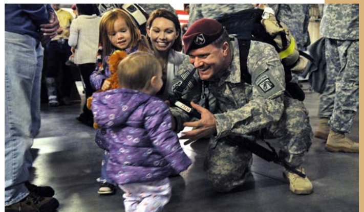
A soldier recently returned from deployment greets his daughter.