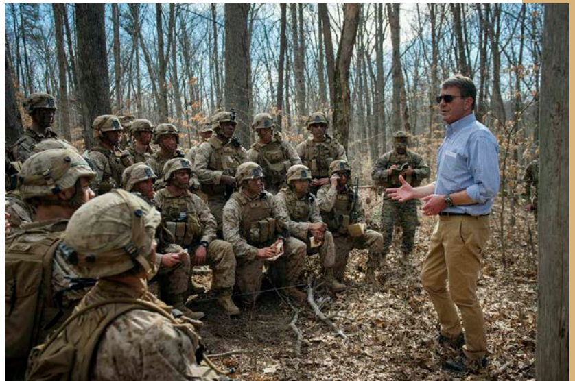
Secretary Carter speaks with Marines at The Basic School participating in a platoon in defense demonstration at Marine Corps Base Quantico, Va.

— though, it's important to remember that restoring readiness requires not only sufficient funding, but also time. The budget maximizes use of the Army's decisive action Combat Training Centers, funding 19 total Army brigade-level training rotations. It provides robust funding to sustain the Navy and Marine Corps' current training levels and readiness recovery plans for FY 2017 — optimizing Navy training while maximizing the availability of naval forces for global operations, and fully funding the Marine Corps' integrated combined arms exercises for all elements of its Marine Air-Ground Task Forces. And, because recent operational demands like the fight against ISIL have slowed the Air Force's return to full-spectrum readiness, the budget increases funding — as part of a $1 billion increase over the FYDP to support Air Force readiness — to modernize and expand existing Air Force training ranges and exercises here at home, providing pilots and airmen with more realistic training opportunities when they're not deployed.