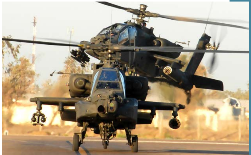
Two AH-64D Apache attack helicopters from 1st "Attack" Battalion, 227th Aviation Regiment, 1st Air Cavalry Brigade, 1st Cavalry Division.

By improving the readiness of the Army's Apache attack helicopters, and better leveraging the diverse capabilities Black Hawk helicopters bring to the table for National Guard missions both here at home and around the world when called upon as an operational reserve, the Army's planned Aviation Restructure Initiative is in the best interests of both the Army as well as the taxpayers who support it.