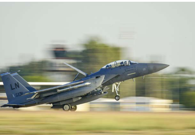
An F-15E Strike Eagle from the 48th Fighter Wing lands at Incirlik Air Base, Turkey, deployed in support of Operation Inherent Resolve and counter-Islamic State of Iraq and the Levant missions in Iraq and Syria.

The terrorist threat is continually evolving, changing focus and shifting location, requiring us to be flexible, nimble, and far-reaching in our response. Accordingly, the Defense Department is leveraging the existing security infrastructure we've already established in Afghanistan, the Middle East, East Africa, and Southern Europe, so that we can counter transnational and transregional terrorist threats like ISIL and others in a sustainable, durable way going forward. From the troops I visited in Morón, Spain last October, to those I visited in Jalalabad, Afghanistan last December, these locations and associated forces in various regions help keep us postured to respond to a range of crises, terrorist and other kinds. In a practical sense, they enable our crisis response operations, counter-terror operations, and strikes on high-value targets, and they help us act decisively to prevent terrorist group affiliates from becoming as great