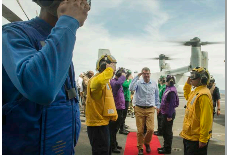
Secretary Carter is saluted by U.S. Navy Sailors as he and Malaysian Minister of Defense Hishammuddin Hussein arrive on the USS Theodore Roosevelt operating in the South China Sea.

The budget also significantly funds important new technologies that, when coupled with revised operational concepts, will ensure we can deter and if necessary win a high-end conventional fight in an anti-access, area-denial environment across all domains and warfighting areas – air, land, sea, space, cyberspace, and the electromagnetic spectrum. While I will address these areas in greater detail later in this posture statement, investments that are most relevant to deterring Russia include new unmanned systems, enhanced ground-based air and missile defenses, new long-range anti-ship weapons, the long-range strike bomber, and also innovation in technologies like the electromagnetic railgun, lasers, and new systems for electronic warfare, space, and cyberspace. The budget also invests in modernizing our nuclear deterrent.