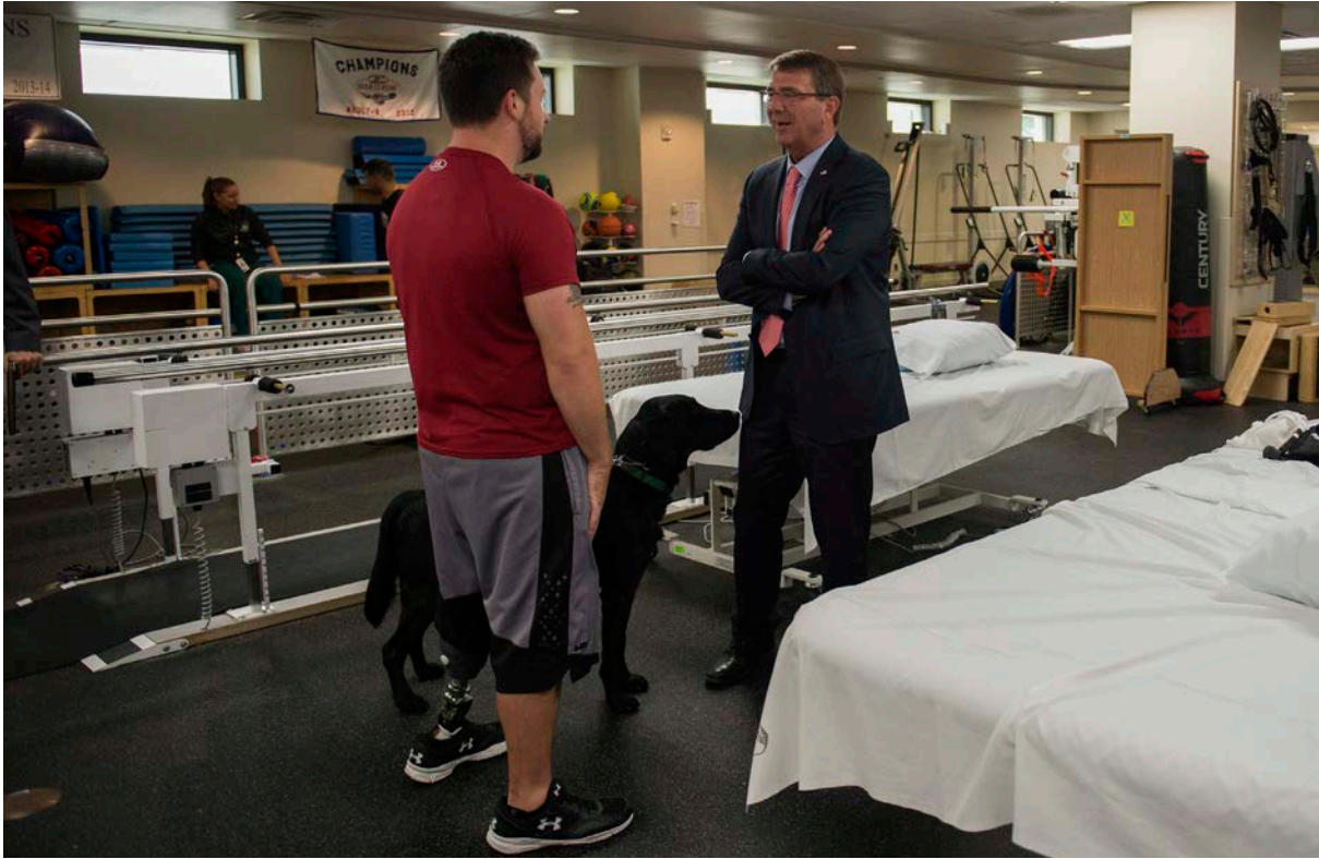
Secretary Carter speaks with a wounded warrior who is receiving care and treatment for his wounds at the Walter Reed National Military Medical Center in Bethesda, Md.

and helping care for our military's wounded, ill, and injured personnel. The budget includes $7.7 billion to support our military families, because they serve too. It includes $3.1 billion to help take care of our wounded warriors, to whom our commitment is and must remain as strong as ever. And it includes our enduring pledge to support the families of the fallen, whose loved ones made the ultimate sacrifice on behalf of our country.