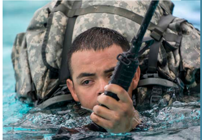
A soldier traverses a water obstacle during a training exercise.

Last spring I asked DoD's Personnel and Readiness chief to lead a team in developing a package of bold proposals, which they did — building on the great work the military services were already doing, and also coming up with some new ideas. Subsequently, a senior leadership team led by Deputy Secretary of Defense Bob Work and Vice Chairman of the Joint Chiefs of Staff General Paul Selva has been working with the service vice chiefs to closely analyze each