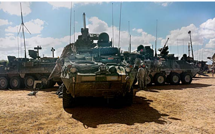
Stryker Combat Vehicles are a phase of Army transformation.

battery and long-range strike, and increased firepower for Stryker armored fighting vehicles. Together these investments comprise $780 million in FY 2017 and $3.6 billion over the FYDP.