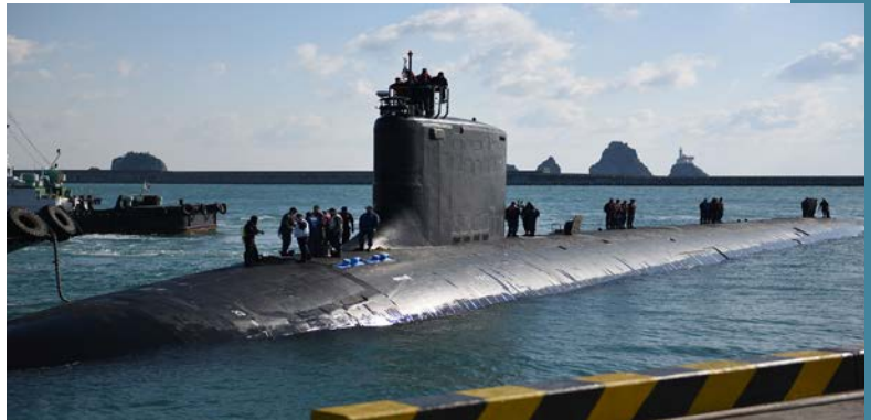
Virginia-class submarine USS North Carolina (SSN-777) pulls into Republic of Korea (ROK) Fleet base.

Second, the budget makes significant investments to bolster the lethality of our surface fleet forces, so they can deter and if necessary prevail in a full-spectrum conflict against even the most advanced adversaries. It invests $597 million in FY 2017, and $2.9 billion over the FYDP, to maximize production of the SM-6 missile, one of our most modern and capable munitions, procuring 125 in FY 2017 and 625 over the next five years — and this investment is doubly important given the SM-6’s new anti-ship capability. It also invests in developing and acquiring several other key munitions and payloads — including $1 billion in FY 2017, and $5.8 billion over the FYDP, for all variants of the SM-3 high-altitude ballistic missile interceptor; $340 million in FY 2017, and $925 million over the FYDP, for the Long-Range Anti-Ship Missile; $221 million in FY 2017, and $1.4 billion over the FYDP, for the Advanced Anti-Radiation Guided Missile, including its extended range version; and $435 million in FY 2017, as part of $2.1 billion over the FYDP, for the most advanced variant of the Tactical Tomahawk land-attack missile, which once upgraded can also be used for maritime strike.