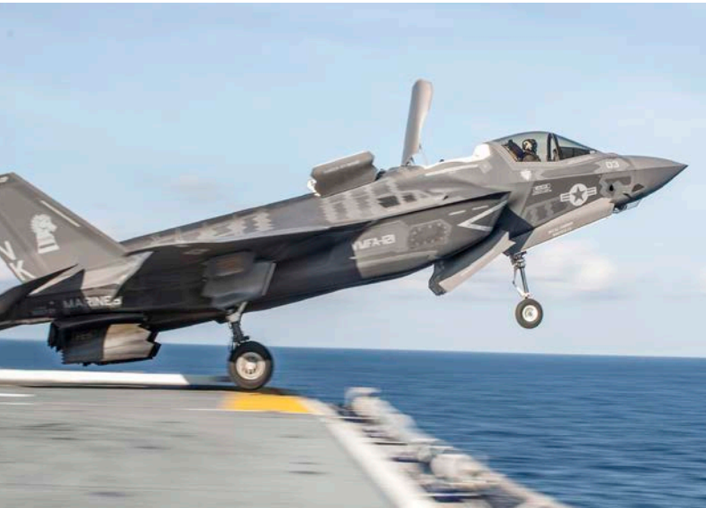
An F-35B Lightning II takes off from the flight deck of USS Wasp (LHD 1).

The investments this budget makes in technology and innovation, and the bridges it helps build and rebuild, are critical to staying ahead of future threats in a changing world. When I began my career, most technology of consequence originated in America, and much of that was sponsored by the government, especially DoD. Today, not only is much more technology commercial, but the