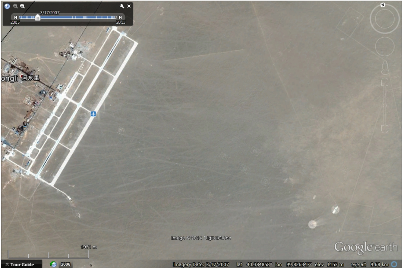
Proximity of Area C to Dingxin Airbase