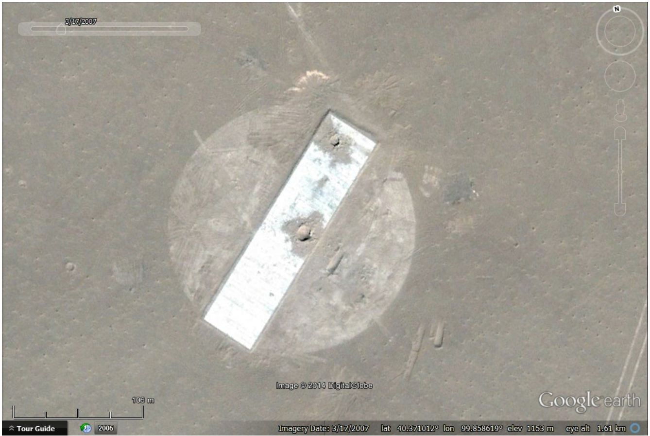
Google Earth image of 2007-03-17 The rectangle measures 200 x 45 meters.