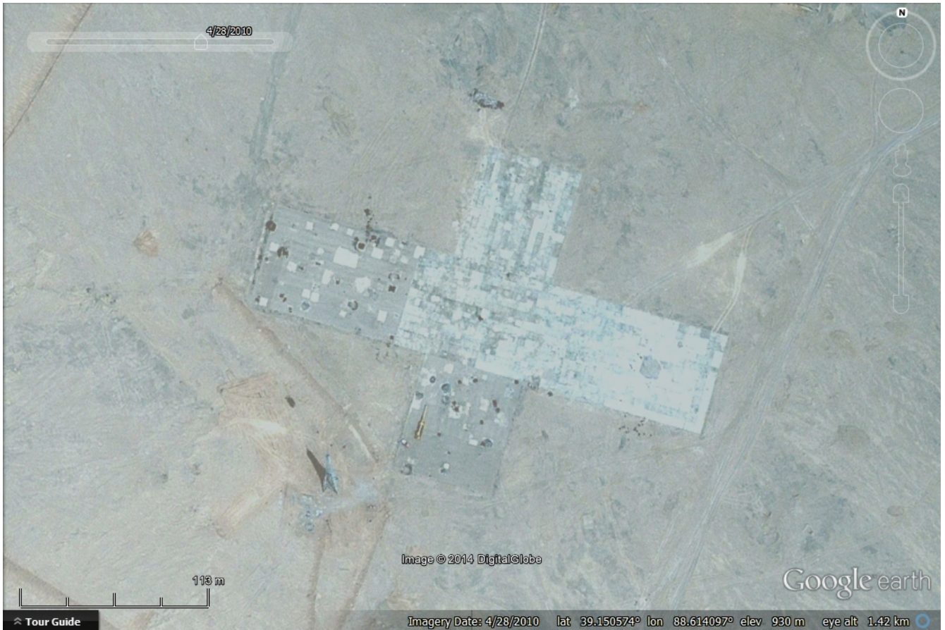
Area B, 2010-04-28