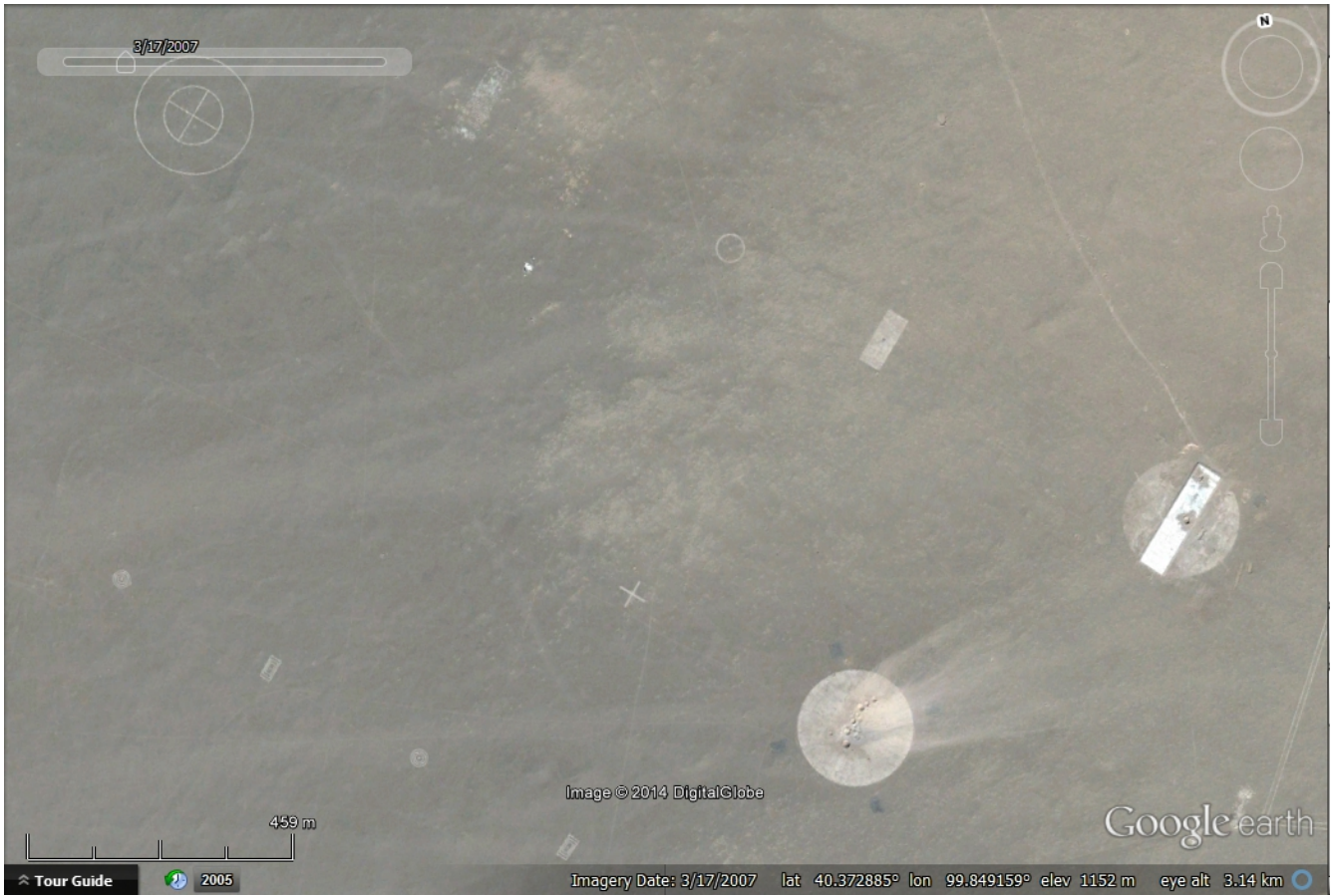
Vicinity of Area C showing other targets and craters.