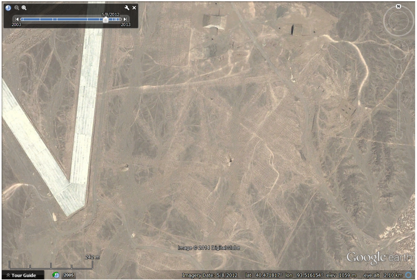
Area A, 2012-05-08