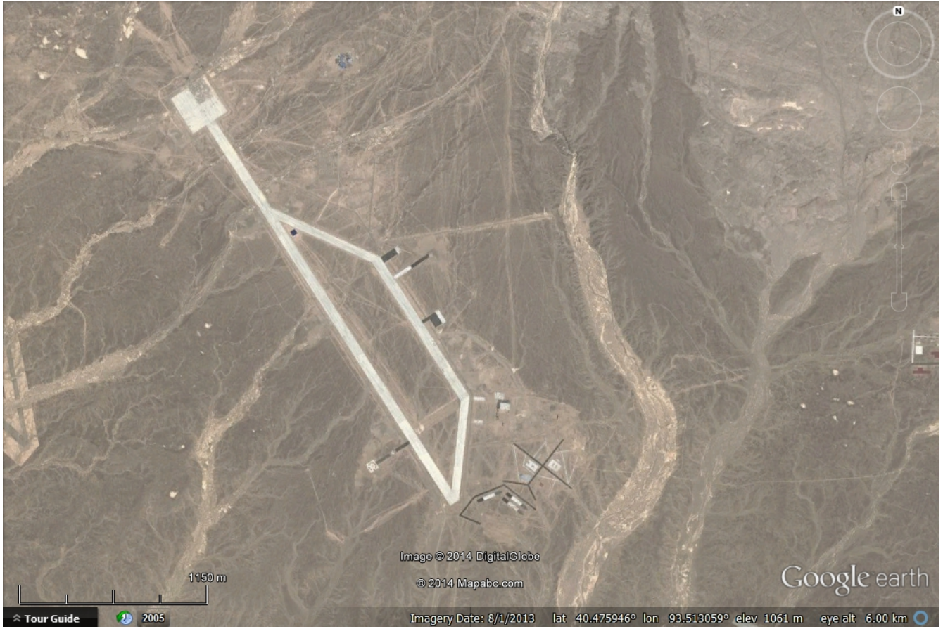
Overview of Area A, 2013-09-01