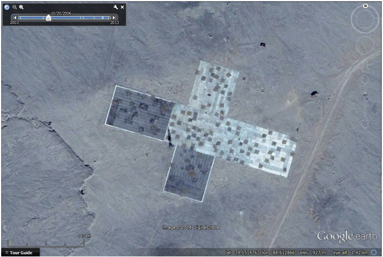
Area B, 2006-10-20