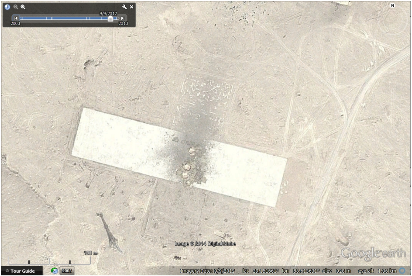
Area B, 2012-09-09