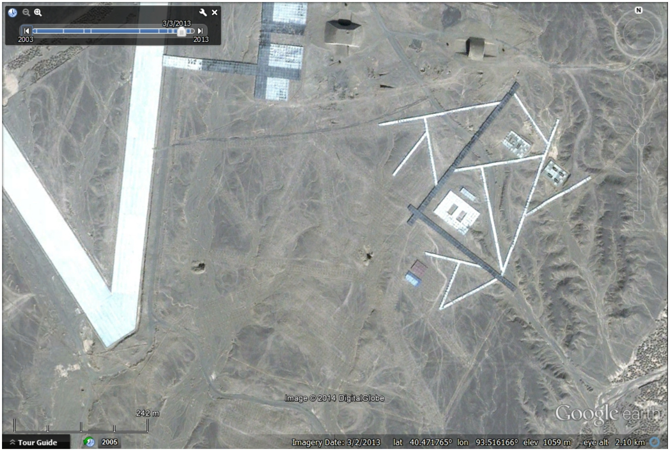
Area A, 2013-03-02