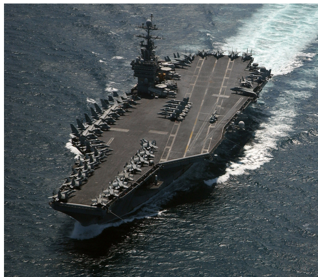
Aircraft parked on carrier flight deck.