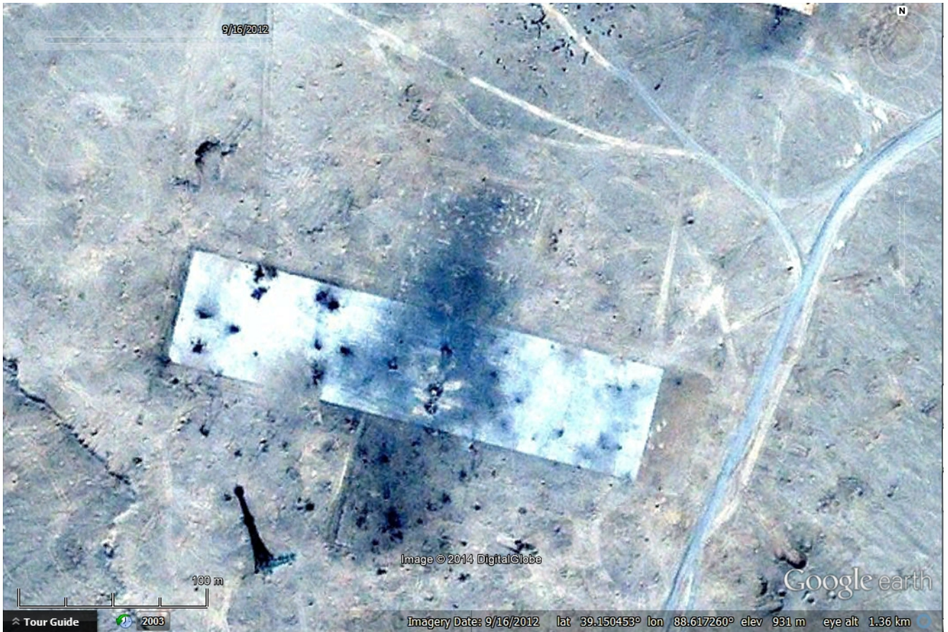
Area B, 2012-09-16