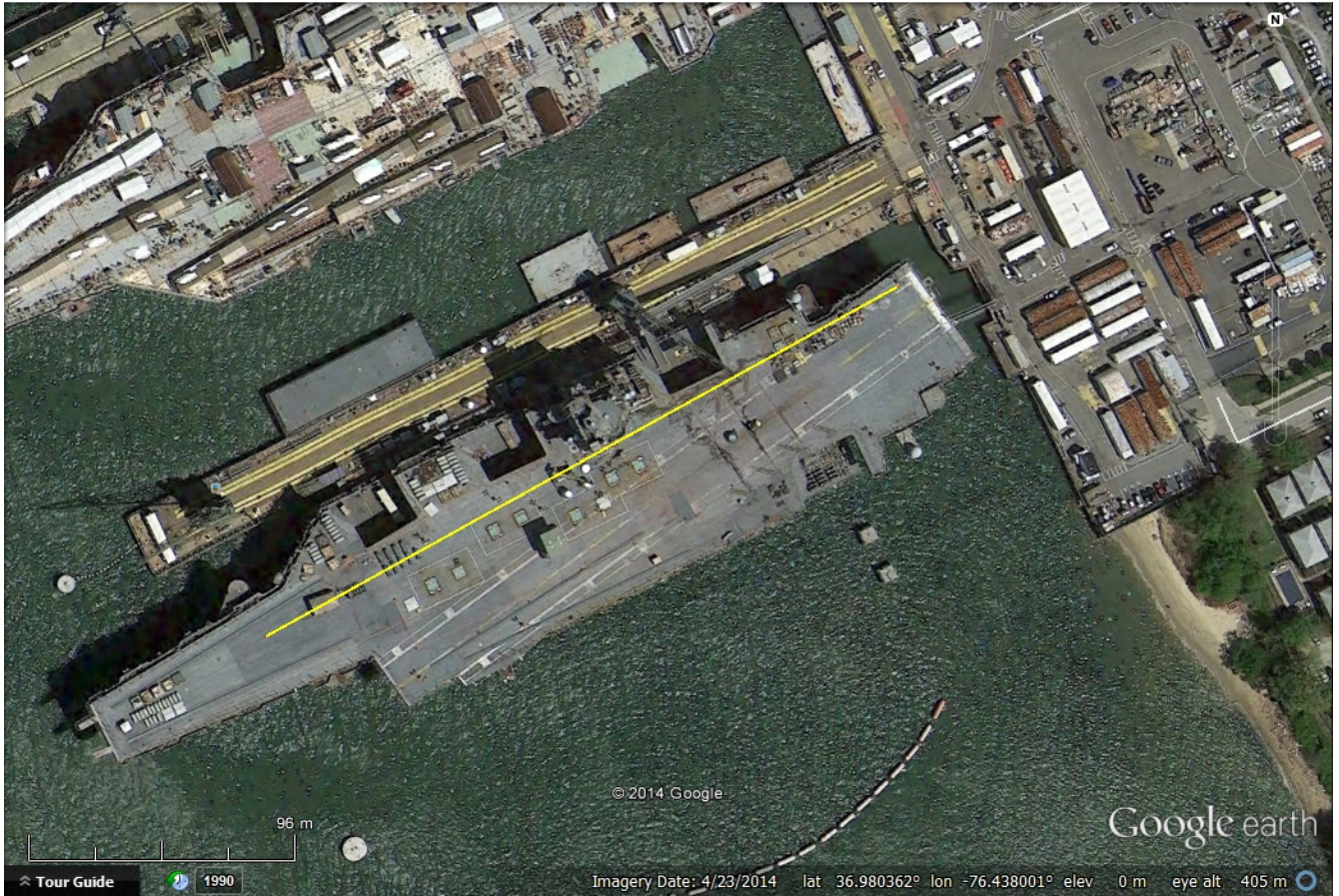
US aircraft carrier at pier side in Newport News, Virginia to the same scale as the above image of Area B. The yellow line running the length of the deck is the same length as the long axis of the white rectangle at Area B.