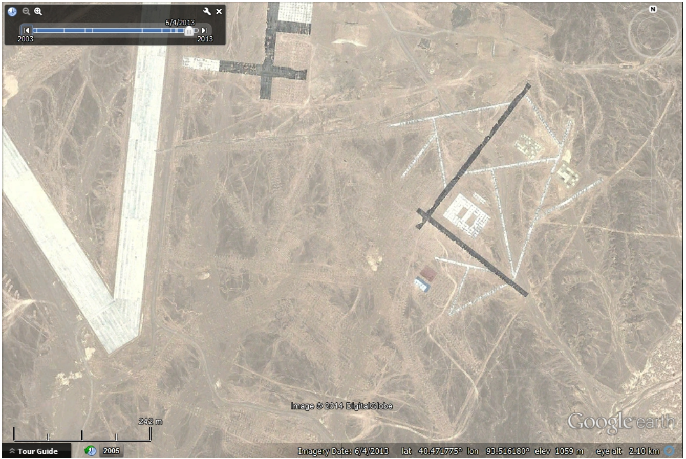
Area A, 2013-06-04