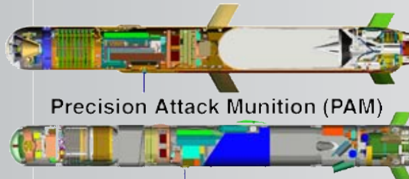
Precision Attack Munition (PAM)