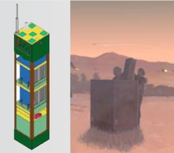
Missile Computer & Commo System