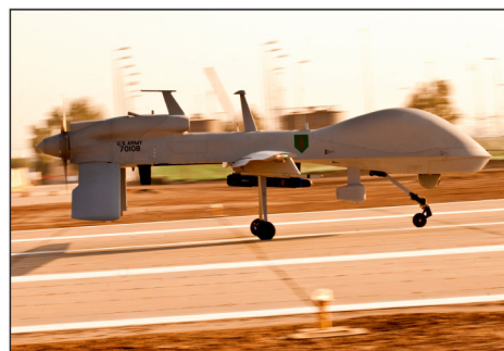
Army Gray Eagle