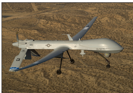
Air Force Predator