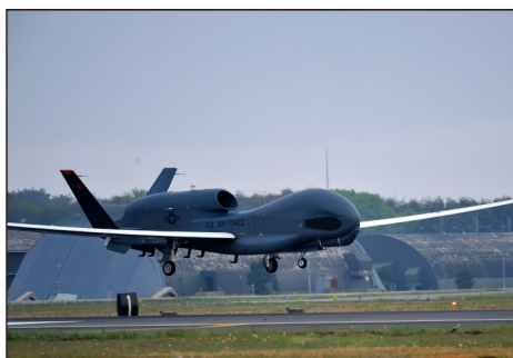
Air Force Global Hawk