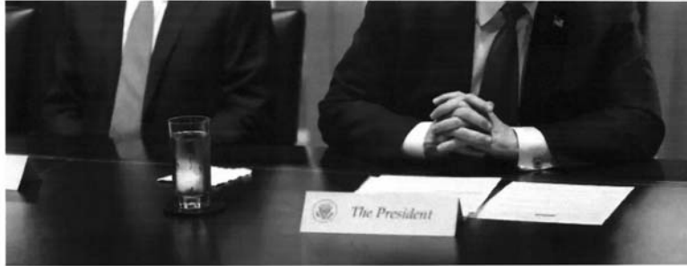
President Donald Trump and Defense Secretary Jim Mattis in the Cabinet Room of the White House.

These Emails Show What Happens When The White House Keeps The Pentagon Out Of The Loop