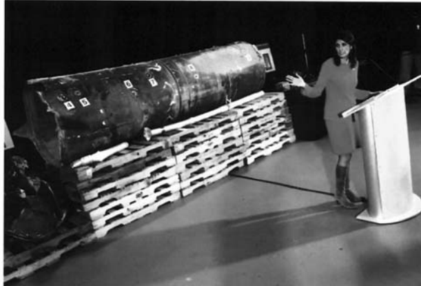
US Ambassador to the UN Nikki Haley briefs the media in front of remains of Iranian 'Qiam' ballistic missile in December 2017.

Saudi Arabia's per capita income has increased almost tenfold, from just over $2,300 in 1978 to more than $22,000 today. Iran's has fallen by more than half, to barely more than $4,000.