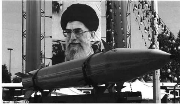
An Iranian nuclear-capable intercontinental Shahab-3 missile is seen during a military exhibition in Tehran.

After almost four decades of malfeasance, we know the Iranian playbook. Tehran promotes sectarianism to divide communities. That leads to weakened or failed nations, which Iran then controls through proxy organizations.