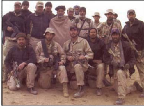
Hamid Karzai (middle row, third from left) and Special Forces.

Pakistan. The mountainous complex sat between the Wazir and Agam valleys and amidst 12,000-foot peaks, roughly 15 kilometers north of the Pakistan border. AQ had developed fortifications, stockpiled with weapon systems, ammunition and food within the jagged, steep terrain. The terror-