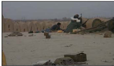
U.S. SOF and NA on the northwest parapet of the Qala-i Jangi Fortress.