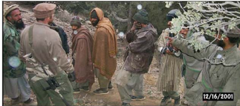
An SF Soldier assists Eastern Alliance Soldiers in supervising al Qaeda Prisoners.

occupying terrain from the combined effort, save nominal Afghan security details.