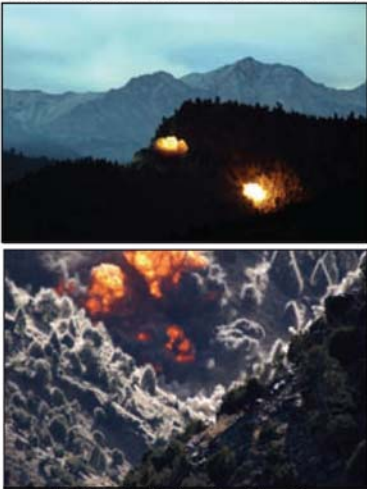
Air Strikes in the Tora Bora Mountains.

As the evaders attempted to clear the danger areas, the men of the SOTF tried to locate any Afghan OP with eyes on the AQ front line and UBL specifically. No such position existed. The Afghan guides who accompanied the SOTF personnel grew extremely nervous as the party approached known AQ positions and refused to go farther. Faced with the improbable circumstance of Ali's return, much less pinpointing UBL's position at night, the quick reaction force (QRF) turned its attention to recovering the evaders. After moving several kilometers under cover of darkness, attempting to ascertain friend from foe, and negotiating through "friendly" checkpoints without requisite dollars for the required levy to pass, the evaders finally linked up with their parent element. All returned to base to reassess the situation and plan for subsequent insertion the following day.