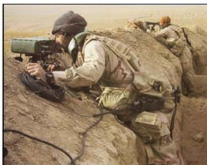
Two SOF operators identify targets.

Beside SF and AFSOC, other SOF combat multipliers made significant contributions to the liberation of northern and central Afghanistan. PSYOP leaflets offered rewards for fugitive Taliban and AQ leaders, informed the Afghan people about their pending liberation, and warned them of the dangers of unexploded ordnance and mines. Civil Affairs teams with TF DAGGER began assessing humanitarian needs