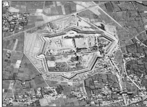
An Aerial View of Qala-i Jangi.

to 29 November, and U.S. SOF assisted the NA forces in quelling this revolt. The ad hoc reaction force—consisting of American and British troops, Defense Intelligence Agency (DIA) linguists, and local interpreters—established overwatch positions, set up radio communications, and had a maneuver element search for the trapped CIA agent. The agent escaped on the 25th. The next day, as the SOF reaction force called in air strikes, one bomb landed on a parapet and injured five Americans, four British, and killed several Afghan troops. The pilots had inadvertently entered friendly coordinates