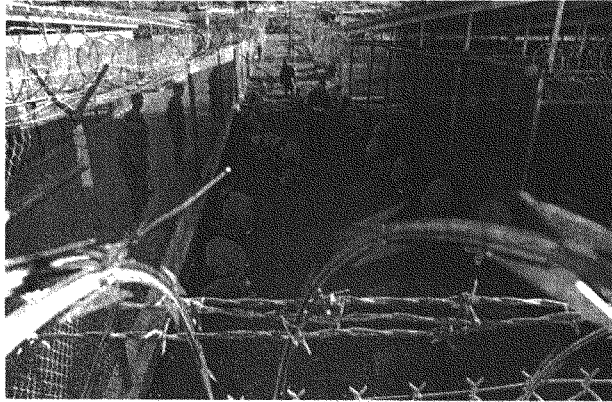
Finally came Category III, for the most exceptionally resistant. Category III included four techniques: the use of "mild, non-injurious January 2002: detainees in a holding area at Guantánamo's Camp X-Ray, the original detention facility, where the first military interrogations took place.

The Green Light: Politics & Power: vanityfair.com